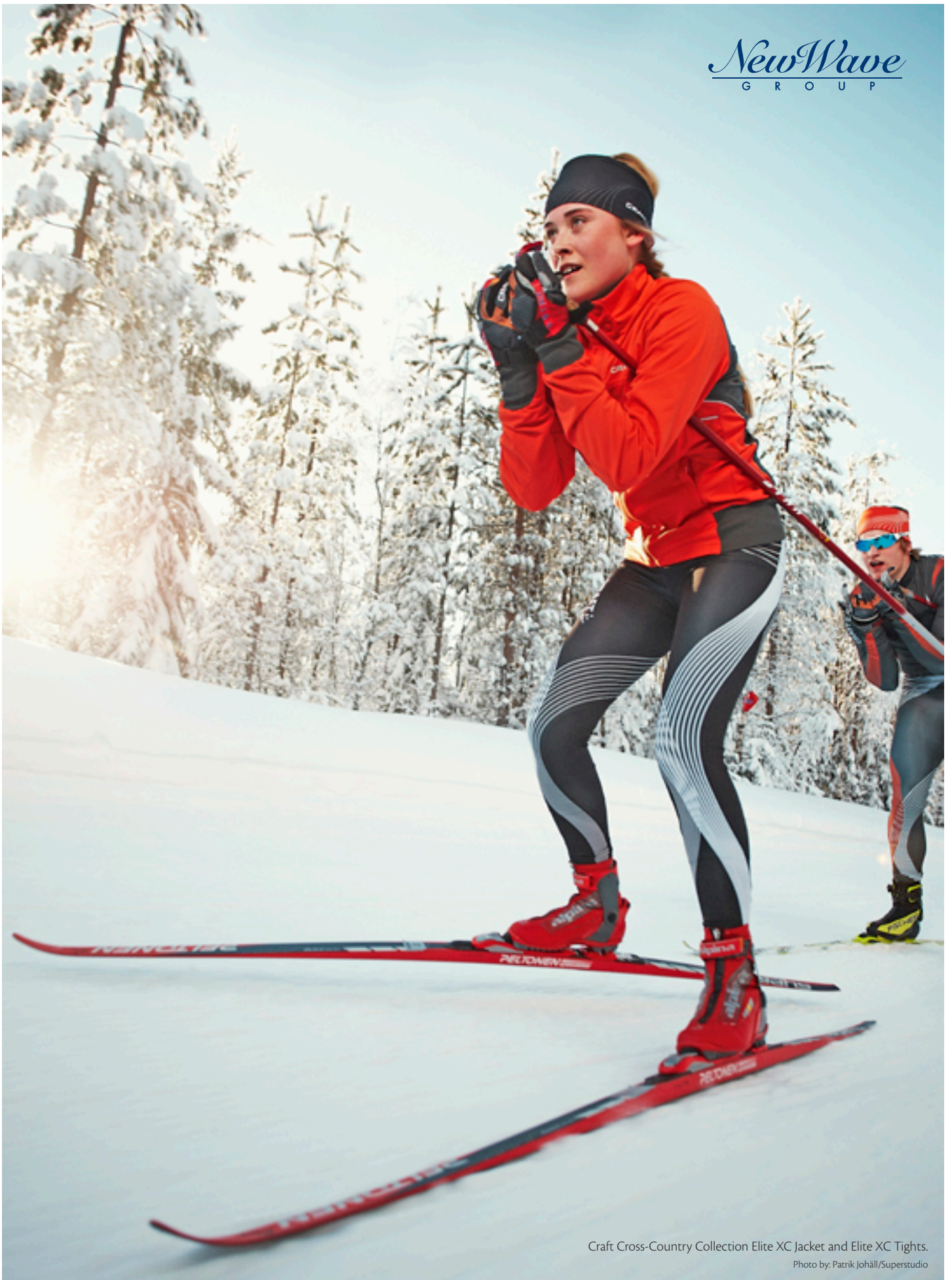
Craft Cross-Country Collection Elite XC Jacket and Elite XC Tights.