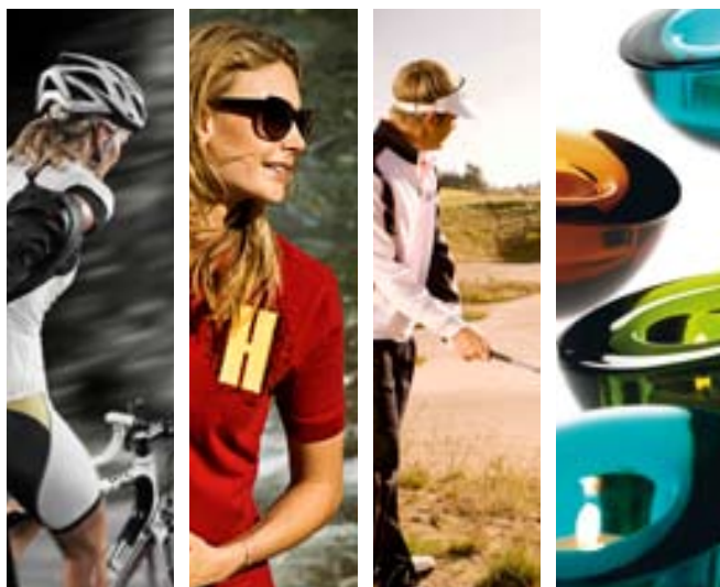
Photos from Craft, Grizzly, Cutter & Buck, and Orrefors.